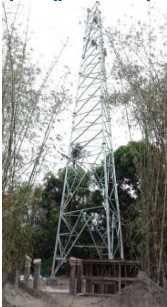
Figure 2: 3- legged tower erected in Yangon for Telenor Myanmar

Note: *excluding the exercise of 264m warrants ** assuming full exercise of warrants Source: RHB